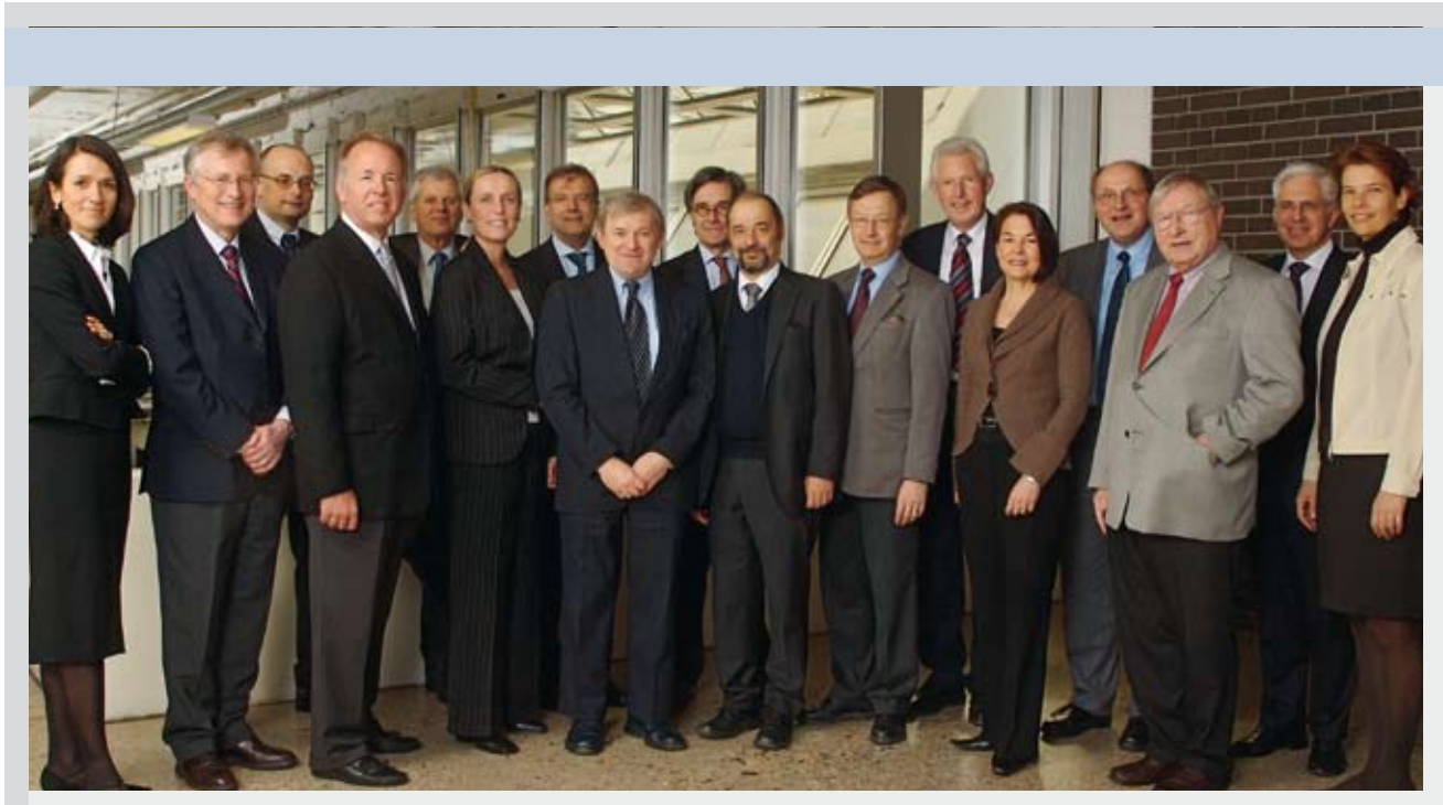
The members of the WU International Board with the Rector's Council

The EQUIS accreditation is in line with WU's constant efforts to improve quality, and represents a unique opportunity to build up long-term co-operations with even more internationally renowned universities and corporate partners.