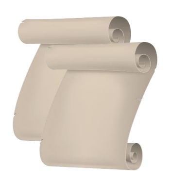
Choice of up to 7 preferences