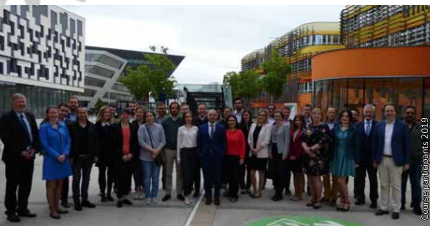
Course participants 2019