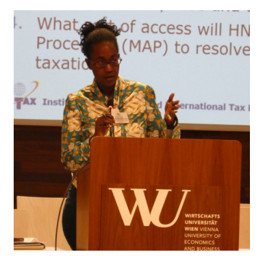
High-Level Conference on High Net-Worth Individuals, Vienna, February 21-23, 2018