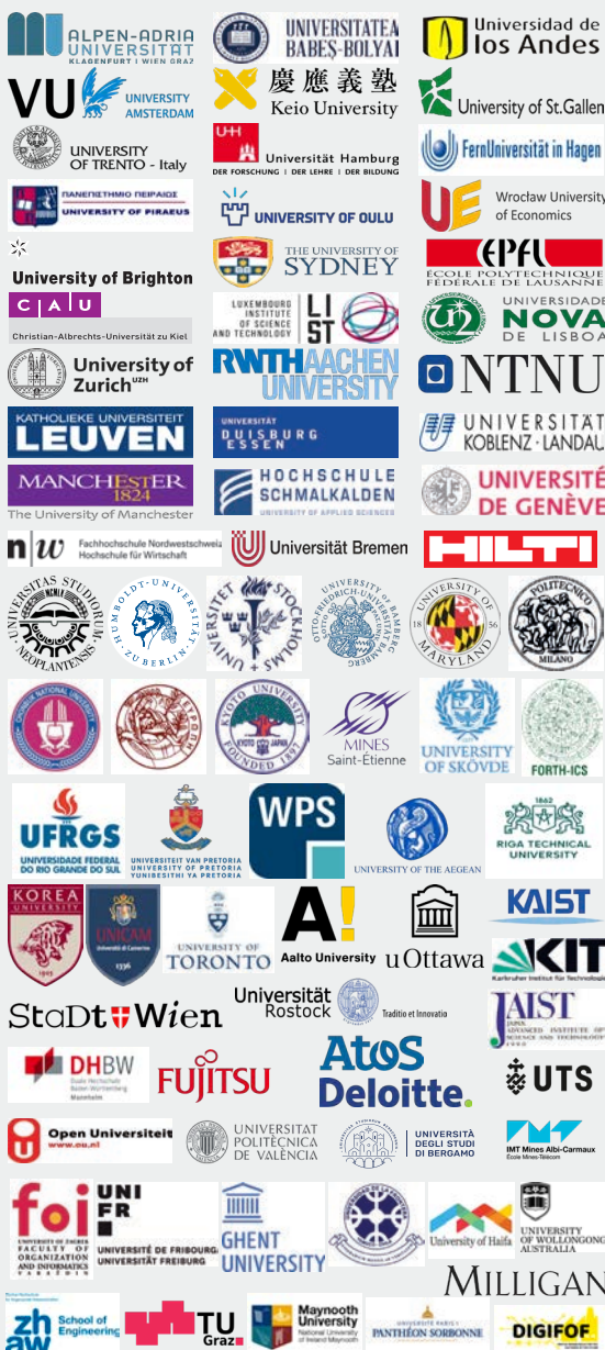
A selection from previous editions.