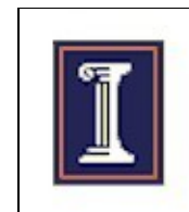
University of Illinois Urbana- Champaign