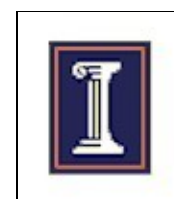
University of Illinois Urbana- Champaign